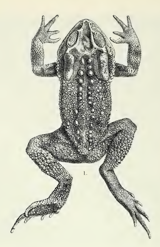
Fig. 1. Dorsal view of Bufo microtympanum, as published by Boulenger (1882).